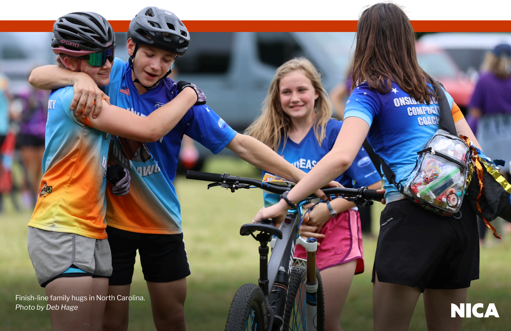
Finish-line family hugs in North Carolina.