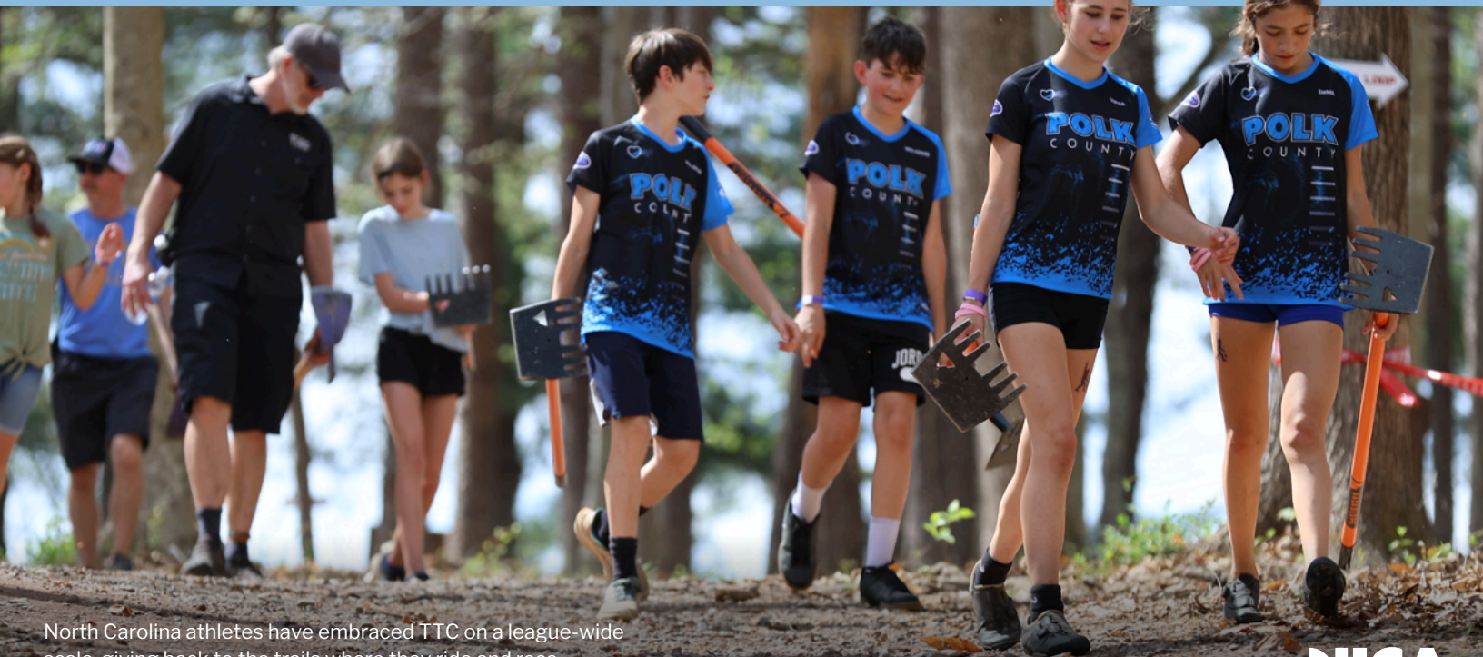
North Carolina athletes have embraced TTC on a league-wide scale, giving back to the trails where they ride and race.

NICA's continued partnership with IMBA and People for Bikes also paved the way for an Advocacy and Action Toolkit , empowering student-athletes to make their voices heard to improve trail access. TTC's impact is evident: 88% of 2024 student-athletes reported a greater respect for trails and the environment. NICA has also made strides in recognizing the contributions of these young trail leaders, with 50% of leagues establishing methods to honor student leaders in TTC.