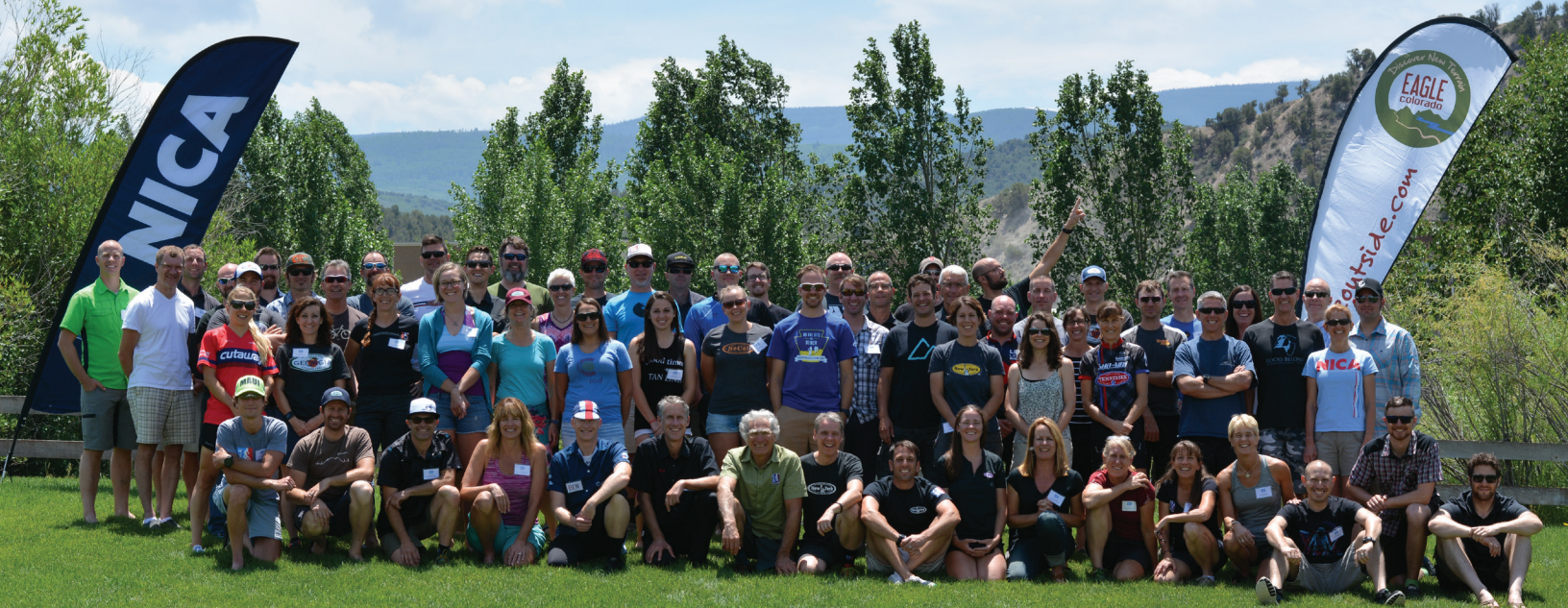
Pictured above: national office staff, league directors, and coach supporters from around the country at the 2016 Annual Conference held in Eagle, Colorado.